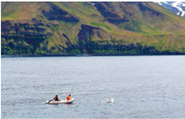
Puma splashdown for ocean recovery. Note that the Puma floats and is not affected by salt water.

The CoA application process emphasizes flight safety, above all else. The FAA requires that unmanned aircraft systems, like manned aircraft, possess an airworthiness certificate. The FAA also considers the aircraft's pilot essential to safe operations. Although an unmanned aircraft is a programmable robot, a trained pilot who can observe see-and-avoid visual flight rules is integral for flight safety.