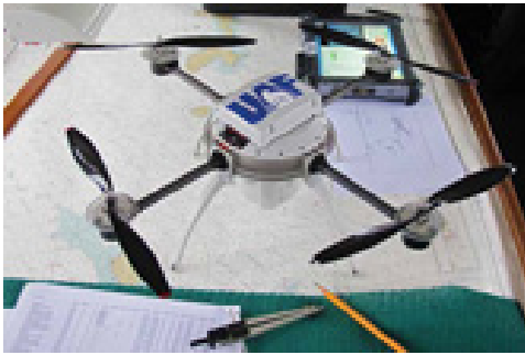
Aeryon Scout quad-rotor assembled from travel case with ground control station on nautical chart.

hand-launched Puma is designed to splash down in the water when its mission is completed and will be equipped with an infrared camera to scout for whales.