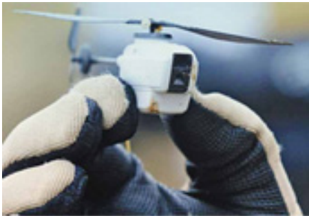
Black Hornet drone used for surveillance by United Kingdom troops in Afghanistan

An explosion of new commercial unmanned aircraft system activity is expected in the United States when the agency releases the new standards in 2015. The Association for Unmanned Vehicle Systems International estimates that as many as 10,000 unmanned aircraft could be flying in the national airspace within 5 years, creating 100,000 jobs and $13.7 billion for the U.S. economy (Space Daily 2013).