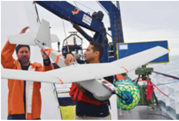
Puma ready for launch from a ship in the Aleutians. Note the oblong device (back right) with a blue panel and yellow trim—this is a radar unit from the University of Alaska Fairbanks to watch for other aircraft in the vicinity.