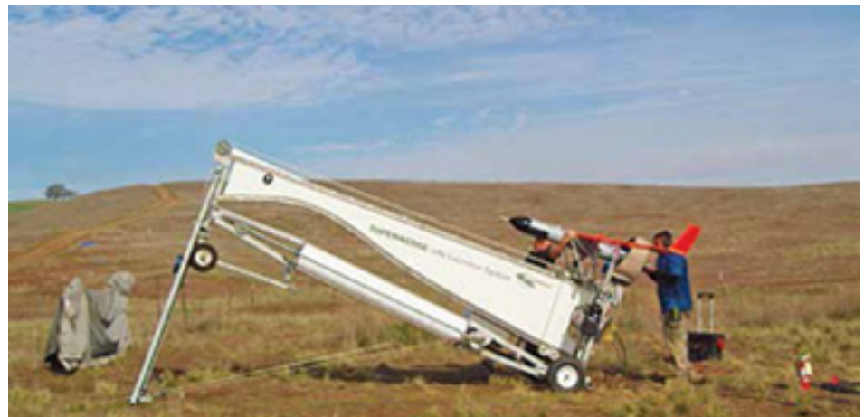
The catapult-launched ScanEagle is a larger model of an unmanned aircraft system.

In addition, the FAA has issued its first commercial restricted category type certificates to ConocoPhillips. The certificates are for two types of unmanned aircraft systems: the 55-pound Boeing ScanEagle and the smaller, 13-pound AeroVironment-manufactured Puma. The catapult launched ScanEagle has a long, 20-hour operational endurance and will be used to monitor sea ice that could interfere with oil exploration. The