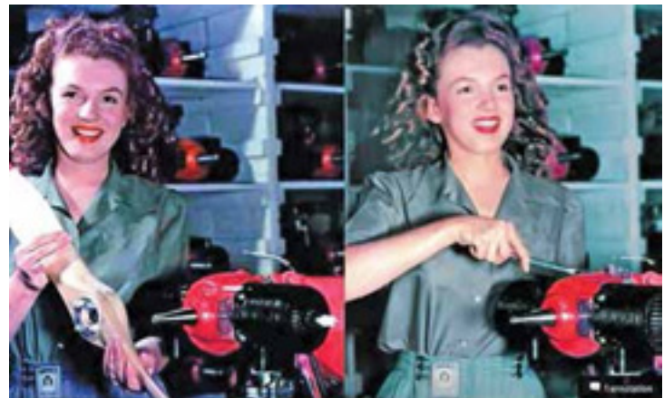
Marilyn Monroe assembling a WWII target drone

unmanned aircraft system operations in the United States are strict and vigorously enforced by the Federal Aviation Administration (FAA) because of aviation safety issues. Currently, all commercial operations in the United States are prohibited from using unmanned aircraft systems without special waivers from the FAA. The rules currently enforced date to 1981 and were created for model aircraft operations (FAA 1981). In 2012 Congress responded to the stringency of these controls by passing the FAA Modernization and Reform Act, which directed the FAA to implement standards for the safe operation of unmanned aircraft systems in the national airspace.